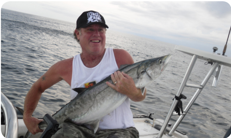
The Central Florida Mills Adventure & Eco Squad

Comments provided during the public hearing process are reported to the Council prior to final action. Your input is considered as the Council deliberates and chooses the most appropriate management measures to address the issue(s) at hand.