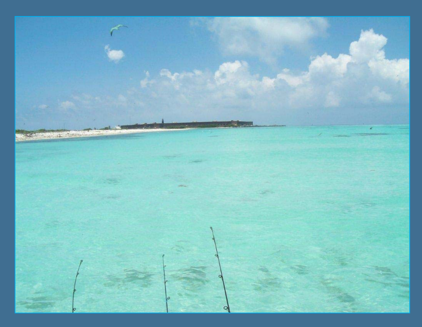
Addressing Fisheries Management in the South Florida Region