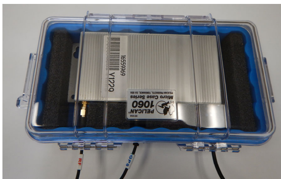
RF Antenna GPS Antenna Power Cable