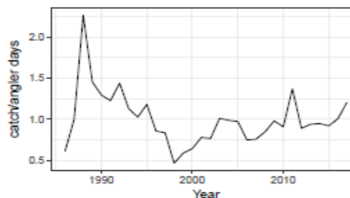
Figure 87: Nominal index (catch/angler days) from headboat logbooks.