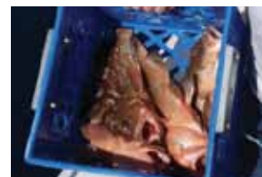
Weighted milk crate