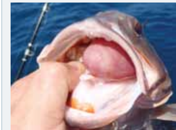
Everted, or protruding stomach

If you see any or all of these signs, the fish will probably need help descending, but sometimes the signs are not readily apparent. Only fish that are unable to swim back down should be subjected to additional handling. If the fish is actively fighting and attempting to swim down when it is brought to the surface it may not need help to be descended. Practice and experience will help you make the best decision.