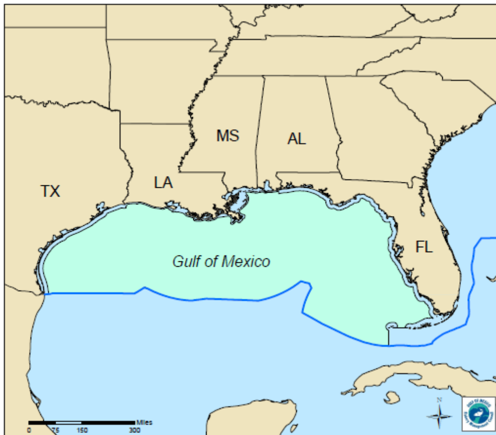
Figure 1.1.1. Jurisdictional boundary of the Gulf of Mexico Fishery Management Council.

Statement. Any events that change the fundamental nature of this proposed action will require a reevaluation of the categorical exclusion to determine its continued validity.