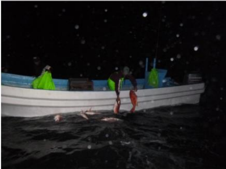
CAPTAIN CONDUCTING DISPOSAL AT SEA OF CATCH