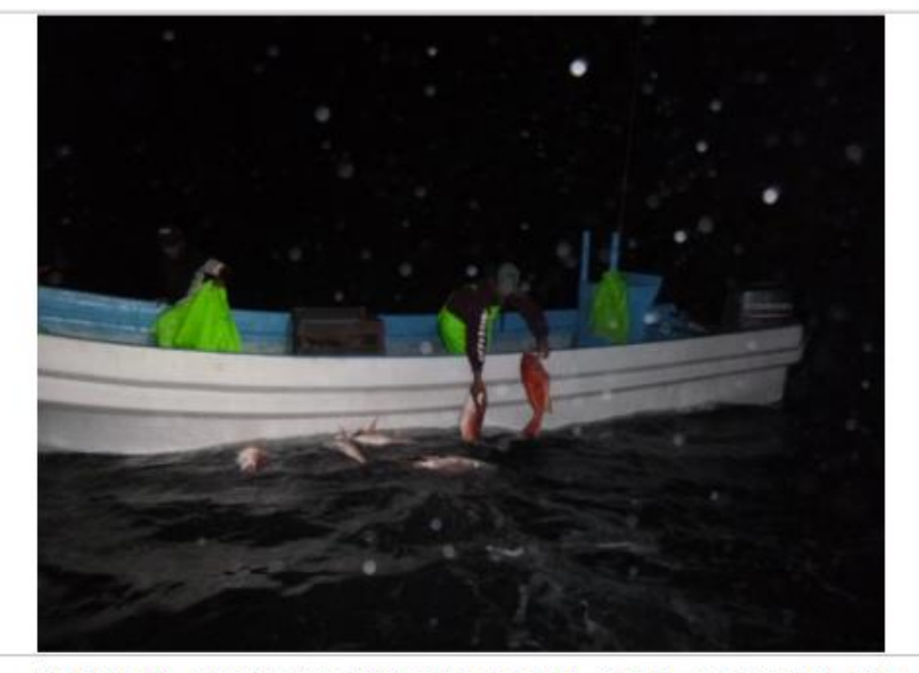
CAPTAIN CONDUCTING DISPOSAL AT SEA OF CATCH