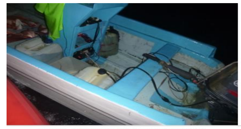
RADIO, GPS AND FUEL CONTAINERS