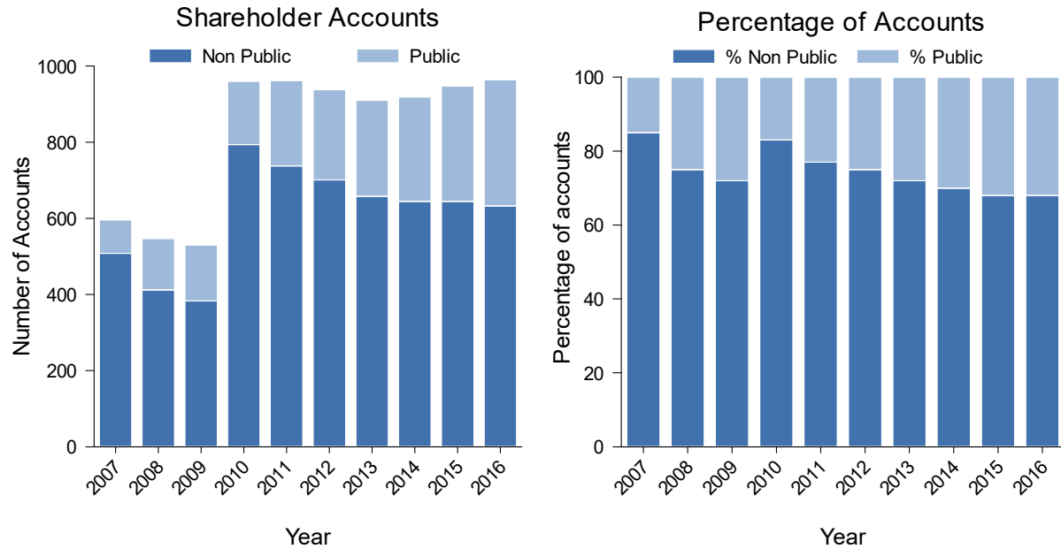
Figure 1.3.1. Public (PP, no permit) and non-public (permit) IFQ shareholder accounts. The figure on the left provides the number of accounts, while the figure on the right provides the percentage of all accounts.